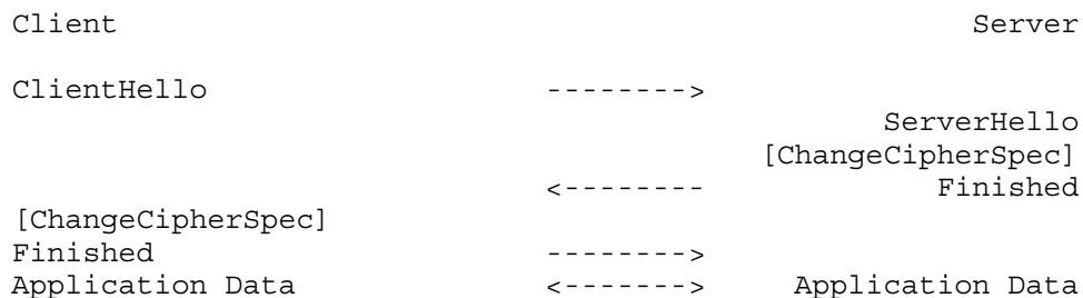
Fig. 2. Message flow for an abbreviated handshake

If a match is found, and the server is willing to re-establish the connection under the specified session state, it will send a ServerHello with the same Session ID value. At this point, both client and server MUST send change cipher spec messages and proceed directly to finished messages. Once the re-establishment is complete, the client and server MAY begin to exchange application layer data. (See flow chart below.) If a Session ID match is not found, the server generates a new session ID and the TLS client and server perform a full handshake.