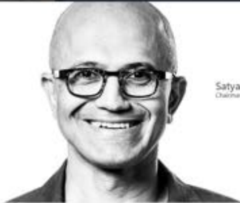
Satya Nadella Chairman and Chief Executive Officer