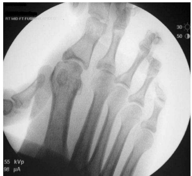
Fig. 4. Intraoperative view after destabilization of the first tarsometatarsal joint and reduction of valgus rotation of the first metatarsophalangeal joint, with the sesamoids rotated into rectus alignment in the frontal plane.