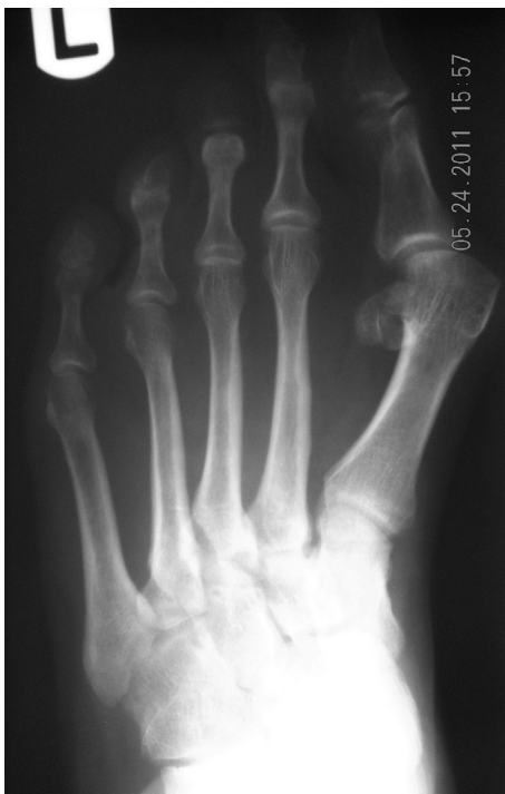
Fig. 2. Preoperative radiograph.

proximal metaphysis of the first metatarsal, perpendicular to the weightbearing surface, and used as a “joy stick.” The original Kirschner wire is then reintroduced for temporary stabilization from the distal first metatarsal into the cuneiform. A third Kirschner wire is introduced as a second point of fixation from the first metatarsal head into the second while applying abductory pressure to the first