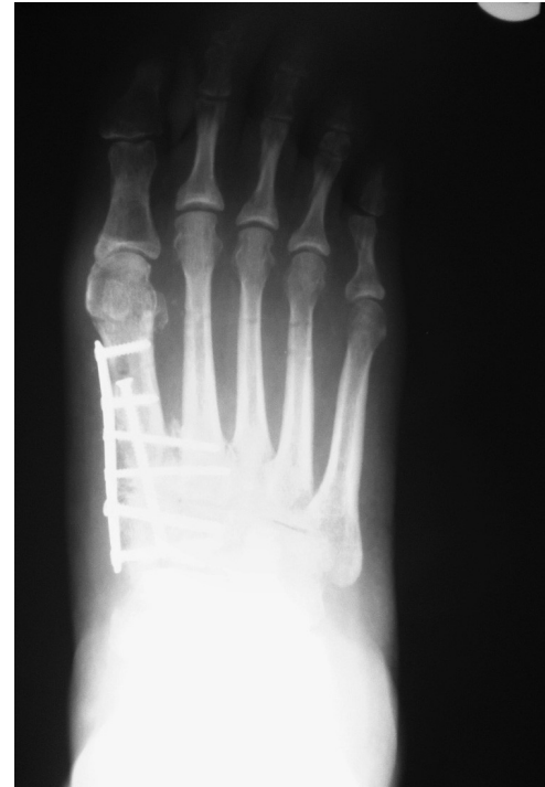
Fig. 6. Postoperative views of the great toe derotated to a neutral position, with complete reduction of the hallux valgus angle and well-aligned sesamoids and metatarsophalangeal joint complex.

metatarsal head. Kirschner wires are used to maintain the correction obtained by these additional maneuvers. Definitive fixation is achieved with a 3.5-mm cortical screw introduced with a lag technique in a “home-run” fashion, as described by Hansen (3). The screw should be as long as possible from anteriorly to posteriorly and should engage the posterior cortex of the medial cuneiform. Finally, a 6-hole combination locking/nonlocking plate is placed to function as a “large washer” in reducing the intermetatarsal angle and maintaining the correction with the locking screws (Figs. 5 and 6).