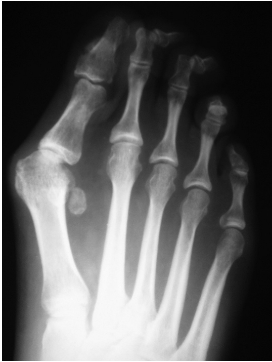
Fig. 1. Preoperative radiograph.