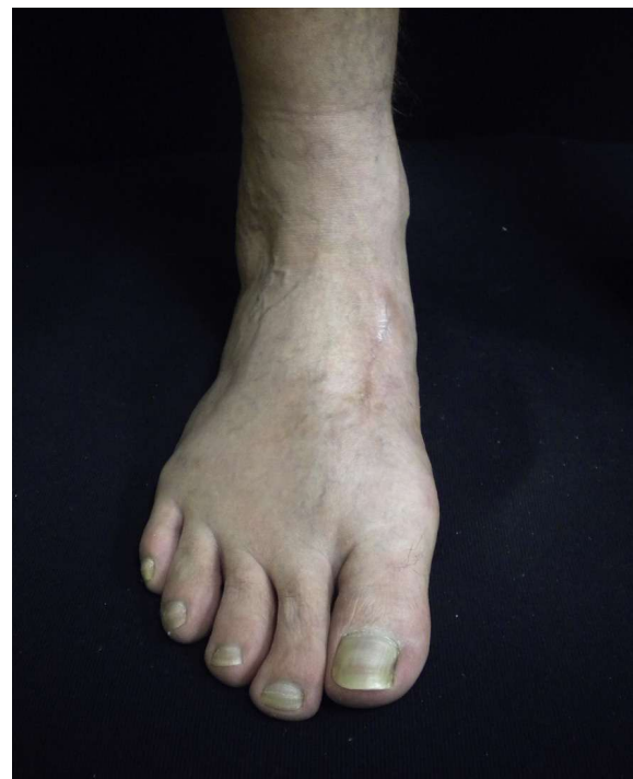
Fig. 7. Clinical photograph of the well-healed foot showing the isolated incision of the tarsometatarsal area.

The sesamoids are housed within an intricate network of ligaments, tendons, and capsular structures, all of which function as a