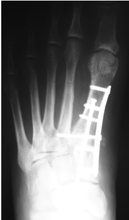
Fig. 5. Postoperative views of the great toe derotated to a neutral position, with complete reduction of the hallux valgus angle and well-aligned sesamoids and metatarsophalangeal joint complex.