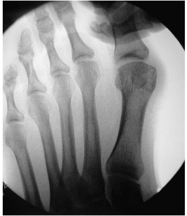
Fig. 3. Intraoperative view after destabilization of the first tarsometatarsal joint and reduction of valgus rotation of the first metatarsophalangeal joint, with the sesamoids rotated into rectus alignment in the frontal plane.

metatarsal complex to be rotated into a neutral position as 1 unit. The sesamoid correction can be observed under fluoroscopy (Figs. 3 and 4). The first tarsal metatarsal joint is pinned with a 2.0 Kirschner wire from dorsally and distally to plantarally and proximally.