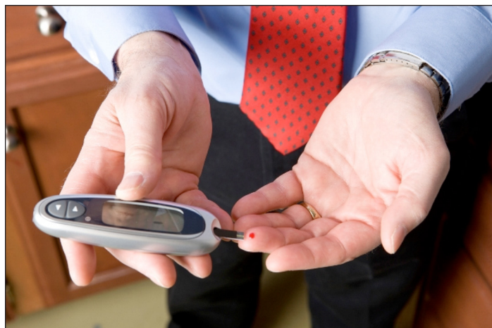
Figure 3. A BG meter measures BG levels from a sample deposited on a test strip. Modern units store information in a memory base for later recall at regular health checks.

Wireless technology promises benefits for medical monitoring applications by freeing patients from inconvenient and restrictive wires. Further, wireless