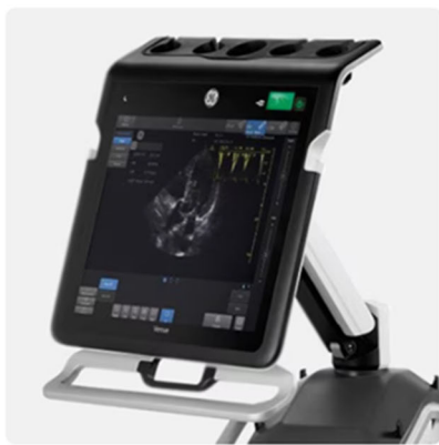
Venue™ Point of Care Ultrasound Designed for simplicity, speed, and precision, Venue is the premier solution of our point of care ultrasound systems.

Whether you're looking for an adaptable model that goes from cart to table to wall, or a console system with a large screen, there is a versatile, robust, and simple system made for your point of care.