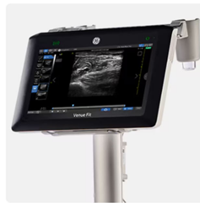
Venue Fit™ Point of Care Ultrasound A simple, fast and precise way to assess a patient's medical status at the point of care, meet Venue Fit, the newest member of the Ve...

https://www.gehealthcare.com/campaigns/venue-family-caption-guidance .