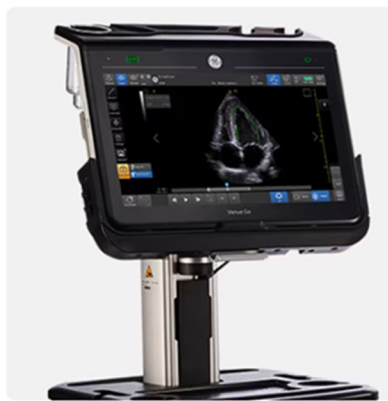
Venue Go™ Point of Care Ultrasound The take anywhere Venue Go adapts to your point of care and allows you to go from cart to table to wall with ease.