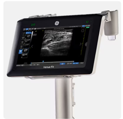
Venue Fit™ Point of Care Ultrasound A simple, fast and precise way to assess a patient's medical status at the point of care, meet Venue Fit, the newest member of the Ve...

https://www.gehealthcare.com/campaigns/venue-family-caption-guidance .