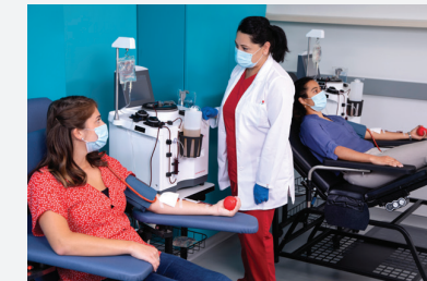
Persona Service and Support offers fully supported implementation and overnight conversion to minimize disruption to center operations.

Longer-term, more personalized experiences can meaningfully increase loyalty and trust, according to research.†† This potentially leads to improved quality and longevity of donor relationships , meeting head-on the difficulty of cost-effectively expanding a donor base and improving retention.