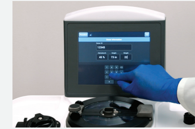
NexLynk DMS® software with Persona™ Technology seamlessly enables plasma collections using the Persona Nomogram.

Plasma collection becomes more personalized to better align with an individual's body composition.