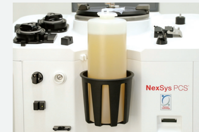
New larger Persona Plasma Pooling Bottle accommodates increased donation volumes.

Uses the Persona™ Nomogram to collect a consistent percentage of plasma volume based on height, weight, BMI and hematocrit across all donors, up to a maximum of 1,000 mL, resulting in an average increase in plasma volume collected per donation†