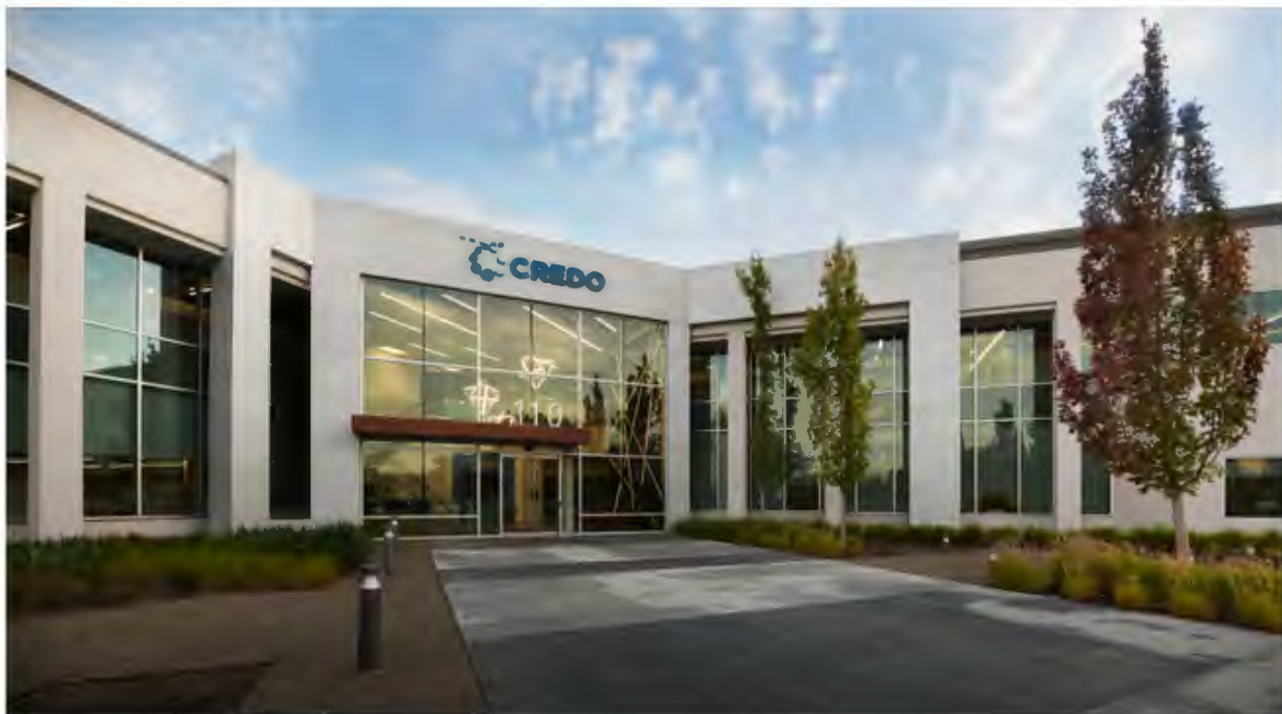
Credo Facility at 110 Rio Robles

104. Credo is headquartered at its facilities in San Jose, California, at 110 Rio Robles (pictured below). These facilities include nearly 90,000 square feet dedicated to Credo employees. Among other things, Credo uses the San Jose facilities for research, development, engineering, design, testing, and repair for the Domestic Industry Products. See id.