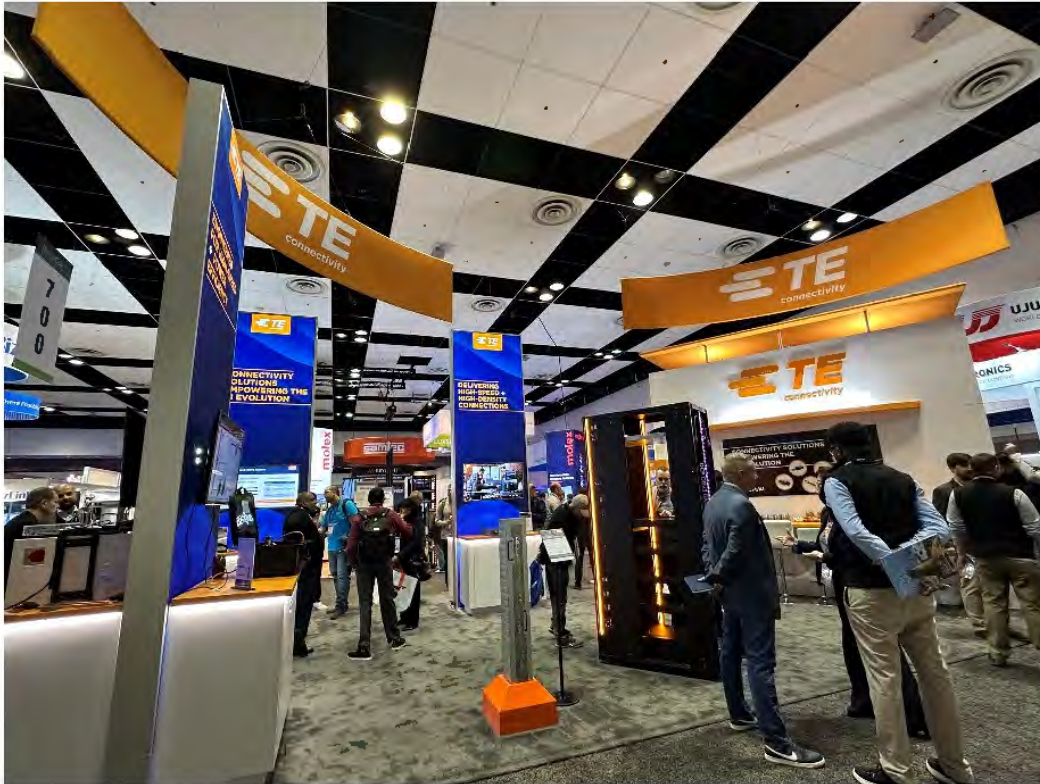
Ex. 24 at 8 (picturing TE Connectivity’s booth and signage at DesignCon 2025 in Santa Clara, California).