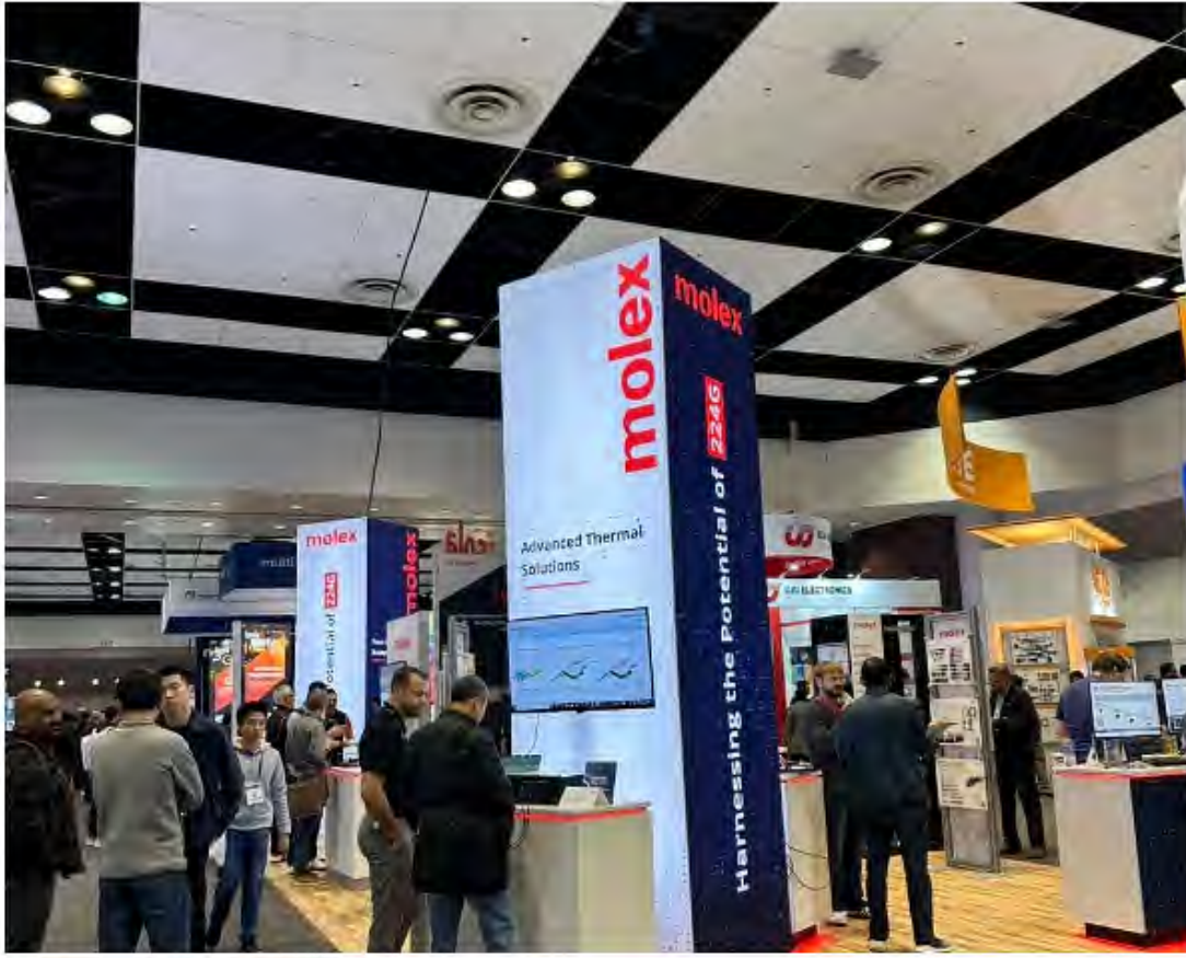
Ex. 24 at 6 (picturing Molex's booth and signage at DesignCon 2025 in Santa Clara, California).