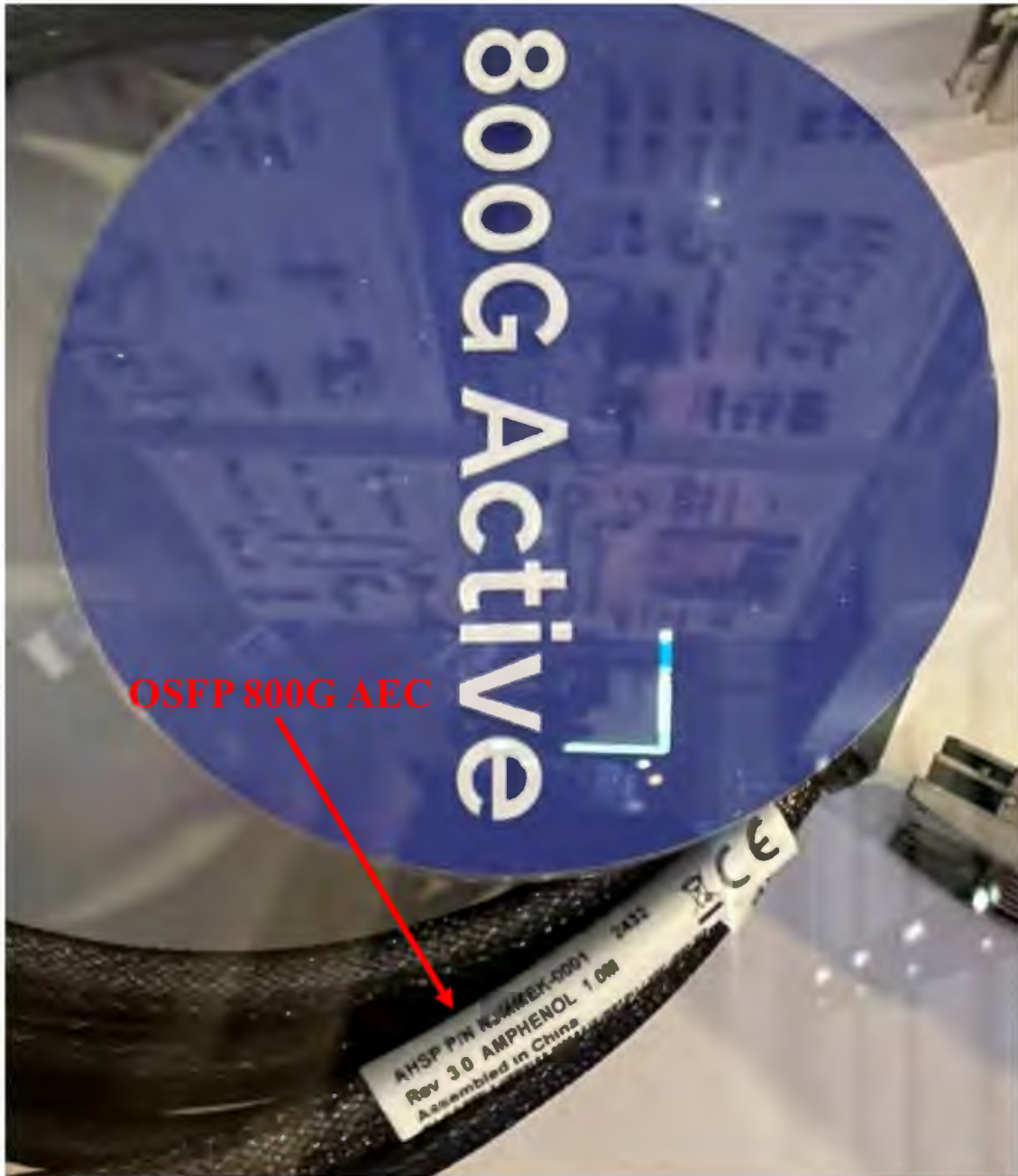
Ex. 24 at 4 (picturing Amphenol Accused Product label stating “Assembled in China” at DesignCon 2025 in Santa Clara, California).