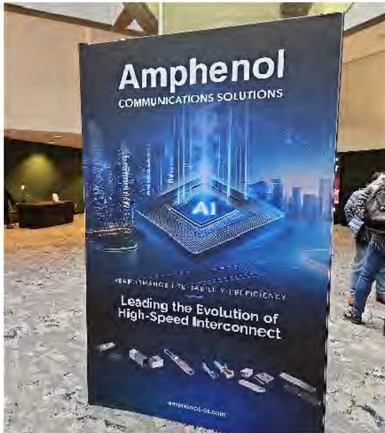
Ex. 24 at 2 (picturing Amphenol's booth signage at DesignCon 2025 in Santa Clara, California).