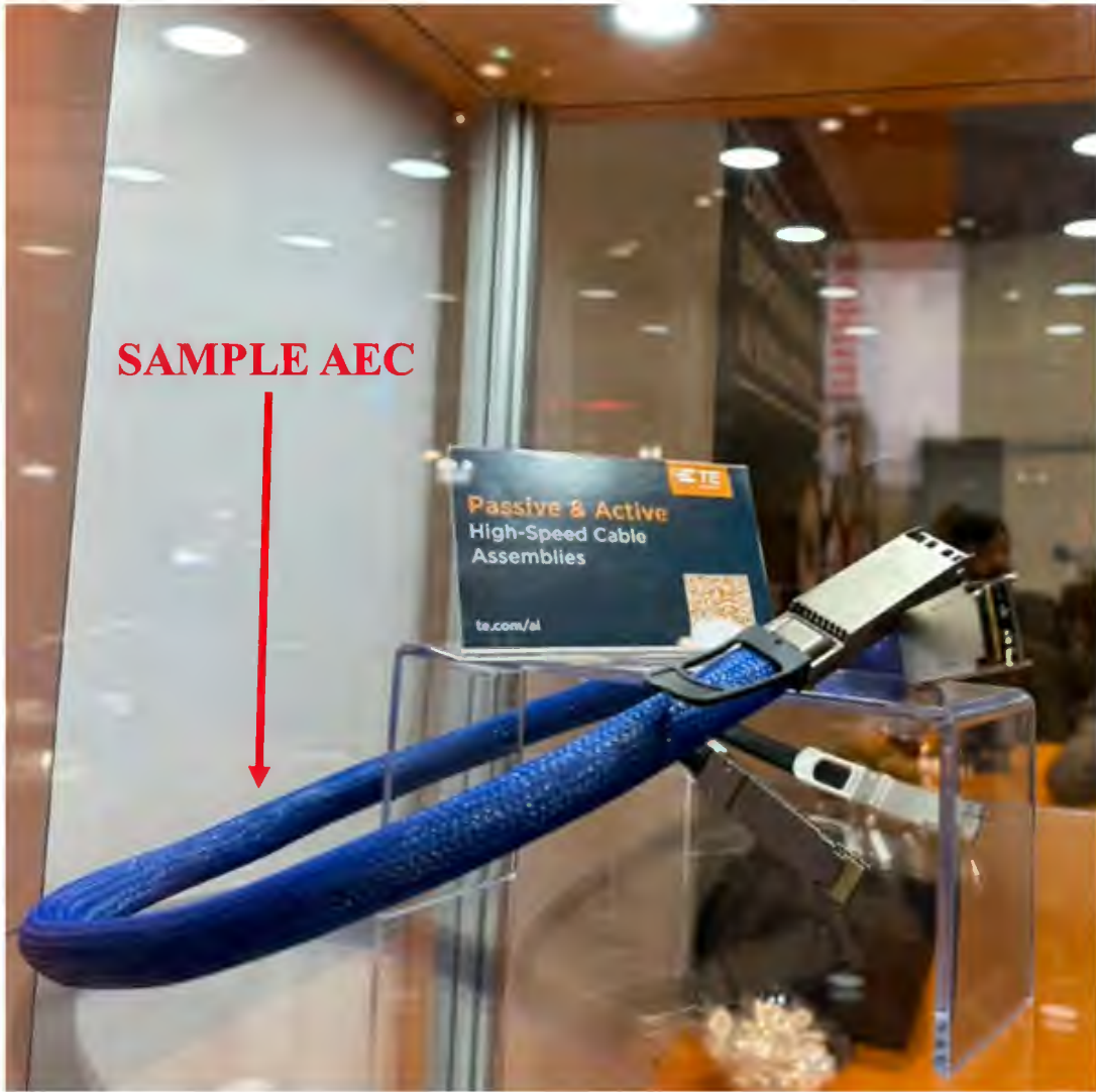
Ex. 24 at 11 (picturing TE Connectivity's display of Accused TE Connectivity Products at DesignCon 2025 in Santa Clara, California).