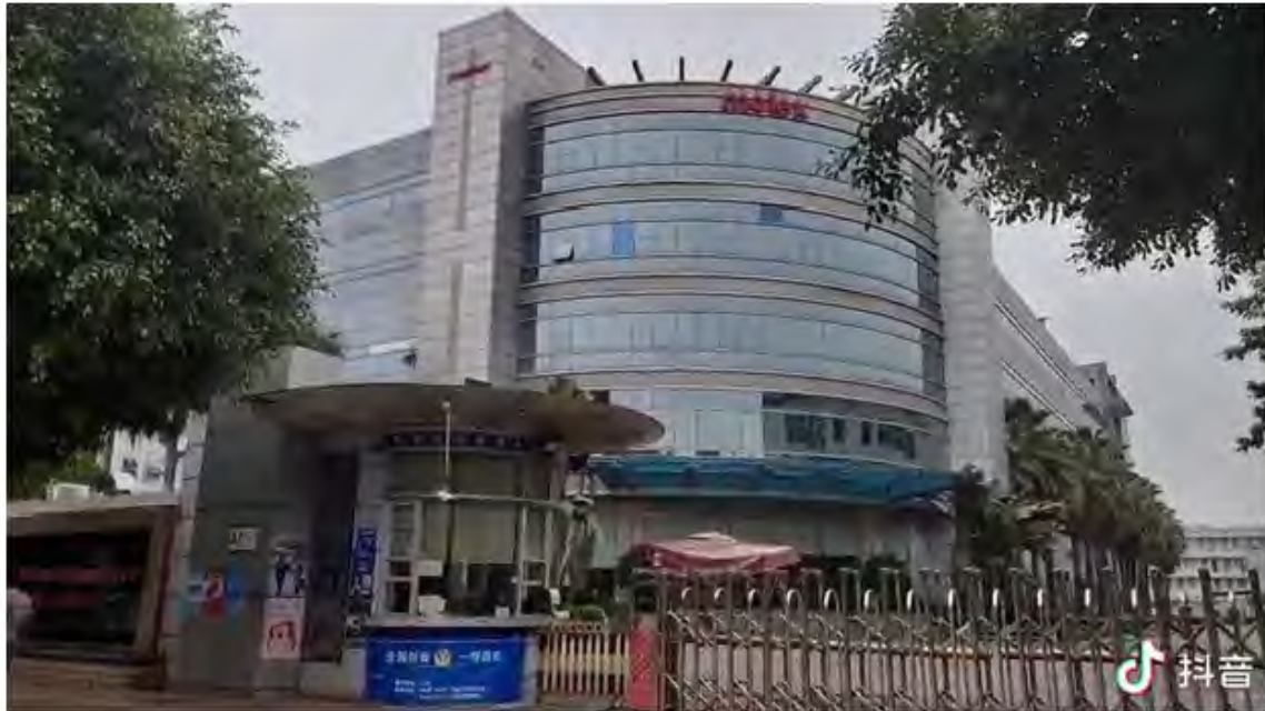
Ex. 16 (video stills from https://www.douyin.com/search/%E7%BE%8E%E5%9B%BD%E8%8E%AB%E4%BB%95%E8%BF%9E%E6%8E%A5%E5%99%A8%E7%AE%80%E4%BB%8B?modal_id=7142675489977650440 ) at 1.