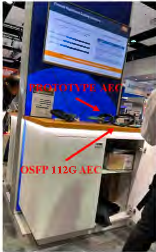
Ex. 24 at 9 (picturing TE Connectivity's display of Accused TE Connectivity Products at DesignCon 2025 in Santa Clara, California).