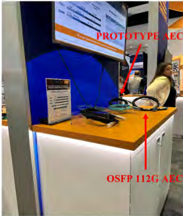
Ex. 24 at 10 (picturing TE Connectivity’s display of TE Connectivity Accused Products at DesignCon 2025 in Santa Clara, California).