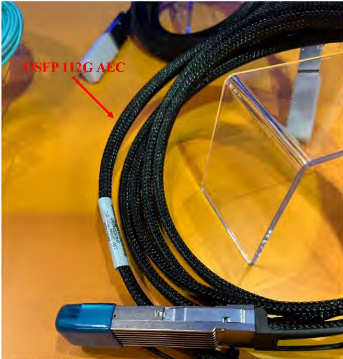
Ex. 24 at 12 (picturing TE Connectivity's display of Accused TE Connectivity Products at DesignCon 2025 in Santa Clara, California).