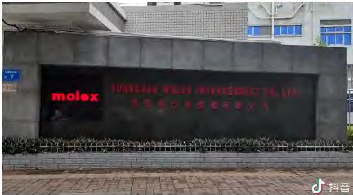
Ex. 16 (video stills from https://www.douyin.com/search/%E7%BE%8E%E5%9B%BD%E8%8E%AB%E4%BB%95%E8%BF%9E%E6%8E%A5%E5%99%A8%E7%AE%80%E4%BB%8B?modal_id=7142675489977650440 ) at 2.