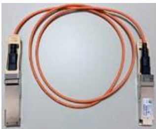
Figure 5. Cisco 40G QSFP Active Optics Cables

Cisco QSFP to QSFP copper direct-attach 40GBASE-CR4 cables (Figure 5) are suitable for very short distances and offer a flexible way to connect within racks and across adjacent racks. Active optical cables are much thinner and lighter than copper cables, which makes cabling easier. Active optical cables enable efficient system airflow and have no EMI issues, which is critical in high-density racks. Cisco currently offers active optical cables in lengths of 1, 2, 3, 5, 7, 10, 15, 20, 25 and 30 meters.