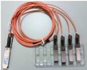
Figure 4. Cisco 40G QSFP to Four SFP+ Breakout Active Optics Cables

Cisco QSFP to four SFP+ active optical breakout cables (Figure 4) are suitable for very short distances and offer a flexible way to connect within racks and across adjacent racks. Active optical cables are much thinner and lighter than copper cables, which makes cabling easier. Active optical cables enable efficient system airflow and have no ElectroMagnetic Interference (EMI) issues, which is critical in high-density racks. These breakout cables connect to a 40G QSFP port of a Cisco switch on one end and to four 10G SFP+ ports of a Cisco switch on the other end. Cisco currently offers active optical breakout cables in lengths of 1, 2, 3, 5, 7, and 10 meters.