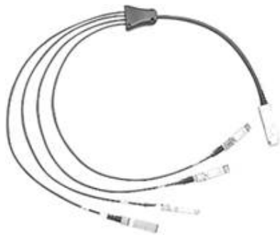
Figure 2. Cisco QSFP to Four SFP+ Copper Breakout Cables

Cisco QSFP to four SFP+ copper direct-attach breakout cables (Figure 2) are suitable for very short distances and offer a very cost-effective way to connect within racks and across adjacent racks. These breakout cables connect to a 40G QSFP port of a Cisco switch on one end and to four 10G SFP+ ports of a Cisco switch on the other end. Cisco currently offers passive cables in lengths of 0.5, 1, 2, 3, 4 and 5 meters and active cables in lengths of 7 and 10 meters.