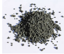
ZrO (Zirconium monoxide)