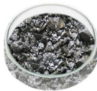
SiO (Silicon monoxide)