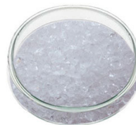
SiO 2 (Silicon dioxide)