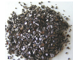
Ti 3 O 5 (Titanium pentoxide)