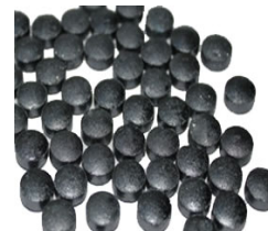
TiO 2 (Titanium dioxide)