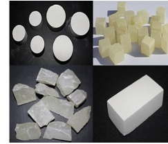
ZnS (Zinc sulfide)