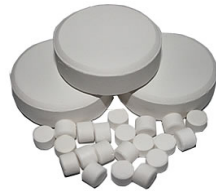
ZrO 2 (Zirconium dioxide)