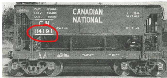
Fig. 2.673—Canadian National 50-ton center discharge ore car for use at Steep Rock mining operations. Built by National Steel Car Corporation, Ltd. Light weight, 40,600 lb.; load limit, 128,400 lb.; capacity, 825 cu. ft.; length inside, 19 ft. 8 in. * (See also page 294)

That Figures 2,670 and 2,673 show the same design is confirmed by the railcar numbers in the schematics and photograph. Figure 2,670 indicates that the schematics shown in the figure were used to manufacture “Series 114,100-114,349”—250 railcars for Canadian National (CN) with those serial numbers. Id. at 27. The railcar in the photograph in Figure 2,673 is one of those 250 railcars: