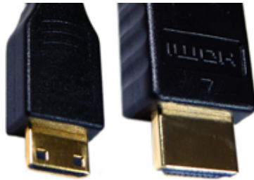
HDMI Standard and Mini Connectors

These minor revisions related to manufacturing or testing issues and did not affect the consumer directly.