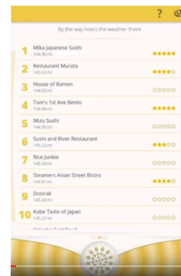
Figure 4: Mobile