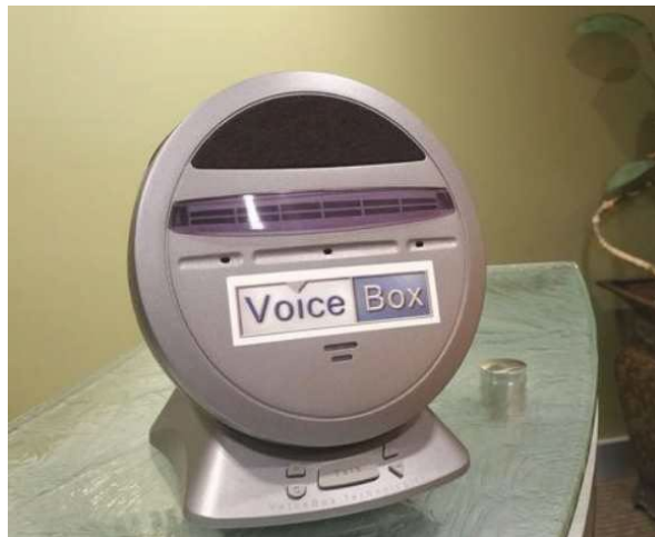
Figure 1: Cybermind Prototype

29. From its inception, VoiceBox Technologies engaged in intense research efforts to develop its NLU technology. As part of these efforts, VoiceBox Technologies achieved a significant milestone when it developed an early prototype called “Cybermind.” As demonstrated on the King5 news, Cybermind was a voice-controlled speaker that could provide weather, recipes, sports scores, calendar updates, or play a song. 2