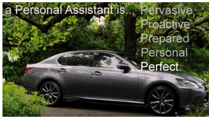
Figure 2: “Alexus” Demonstration

31. As part of the development effort of an NLU interface for Lexus, VoiceBox Technologies demonstrated a personal assistant called “Alexus” that showcased the power of its Conversational Voice technology.