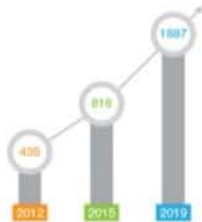
Merger & Acquisitions Track Record