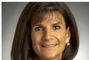
Patricia F. Russo