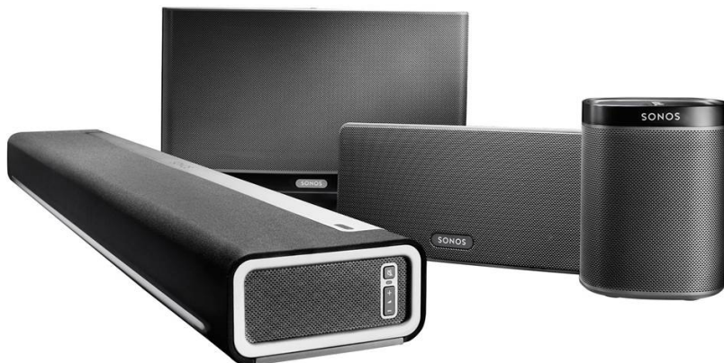
The Sonos speaker lineup includes the large Play:5, the medium Play:3 and the brand new little Play:1, along with the PlayBar soundbar.

The explosion of smartphones and tablets, the advent of all-you-can-eat subscription streaming music services like Spotify and MOG, and improvements in audio and networking technology, have all benefitted Sonos as it has evolved. Now you can get a very sweet set-up for under a grand, and control it with an iPhone, iPad or Android device.