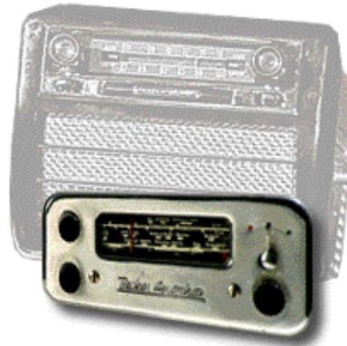
Early Becker radios.

The history of Becker is almost like the history of the car radio itself. With humble beginnings in 1945, Becker has now become one of the leading suppliers for prestige vehicles in the world. Brands such as Mercedes-Benz, BMW, Porsche and Ferrari select Becker as one of their main OEM (Original Equipment Manufacturer) suppliers for car audio and now car entertainment and navigation systems.