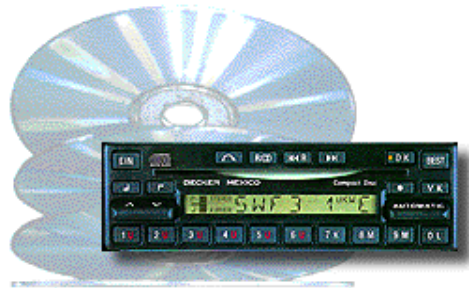
Becker Mexico 860 CD Radio