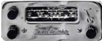
The first Becker, the Aerophon.