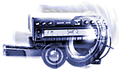
Becker radio and speaker collection.