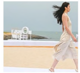
The Third Consumer Expo Fashion Week Ends