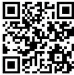
Campus Recruitment Exchange Group (QQ Group): 894790232