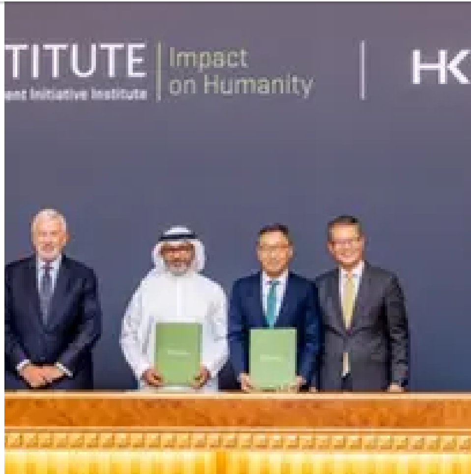
INVESTMENT HKSTP and seven Hong Kong tech ventures forge partnerships at FI18