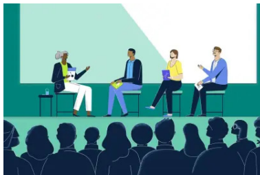
Our leadership team