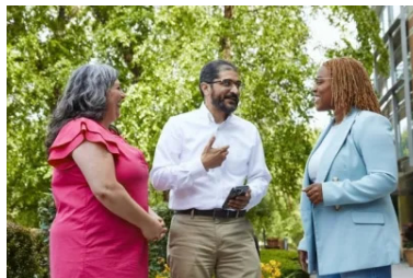
Diversity and inclusion

We're committed to fostering an environment of belonging, engagement and empowerment.