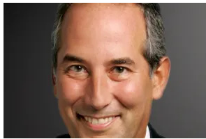
Thomas H. Glocer