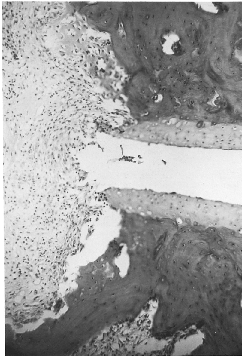
FIG. 2. Section of ankle joint taken approximately 2 wk after onset of type II collagen-induced arthritis. Synovial proliferation and intense infiltration by mononuclear cells is producing cartilage and bone erosion. Hematoxylin and eosin \times 200 .

and sections of the trachea showed no evidence of generalized cartilage inflammation. Likewise, histologic examinations of the skin, lung, and kidney were normal.