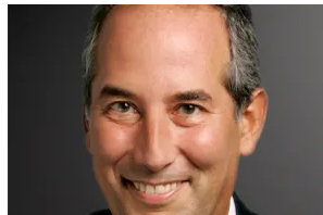
Thomas H. Glocer