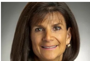
Patricia F. Russo