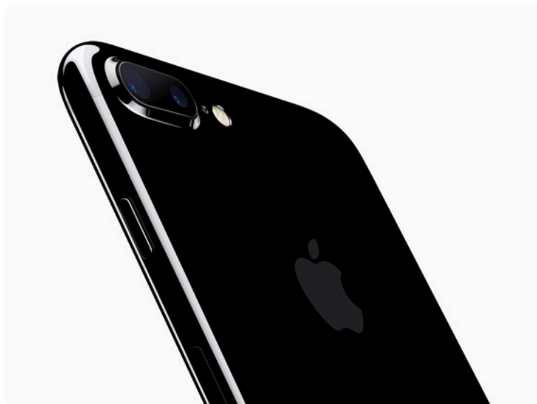
Portrait mode demonstrates the power of the dual-camera system in iPhone 7 Plus.

Portrait mode now available on iPhone 7 Plus with iOS 10.1 - Apple cameras, turns the camera you carry around with you everyday into an even more powerful photography tool.